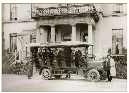
First organised tours launched by Thomas Cook in early 1900s.