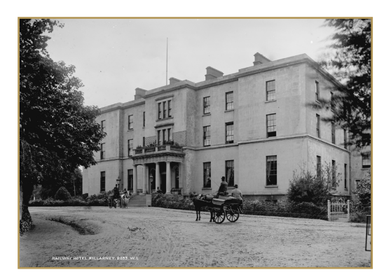
Great Southern Railways opened the hotel in July 1854.

Today, Brownes Bar welcomes guests from all over the globe, looking to sample some of Killarney's finest food & beverages. Make sure to stop by our Whiskey Corner which houses a collection of over 100 of the world's finest Whiskeys from Ireland, Scotland, America, Canada, Wales and Japan.