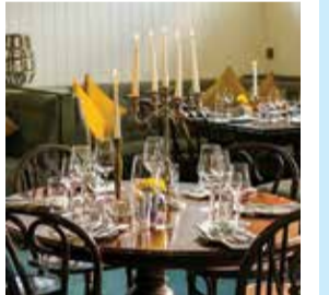
The Strand Cahore Cahore, Co. Wexford