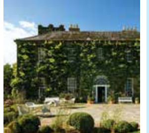
Ballymaloe House Hotel & Restaurant Shanagarry, Co. Cork