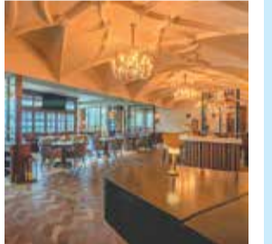
Arkle Bar, Glenroyal Hotel & Leisure Club Maynooth, Co. Kildare