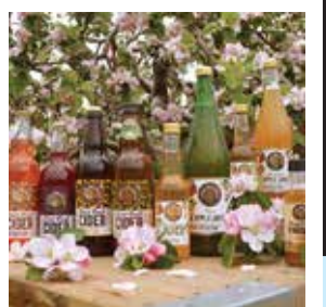
Long Meadow Cider Portadown, Co. Armagh