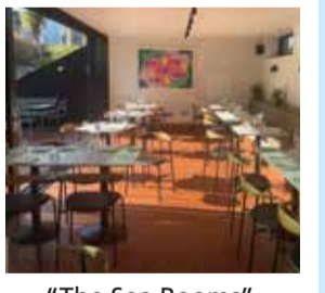
"The Sea Rooms" Restaurant, Kelly's Resort Hotel & Spa Rosslare, Co. Wexford