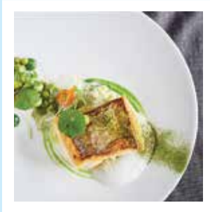
Lemon Tree Restaurant Letterkenny, Co. Donegal