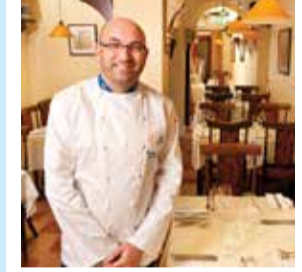
An Port Mór Restaurant Westport, Co. Mayo