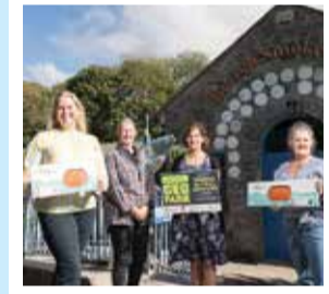
Burren Smokehouse & Visitor Centre Lisdoonvarna, Co. Clare