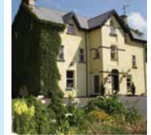
Carrigerry Country House & Restaurant Shannon, Co. Clare