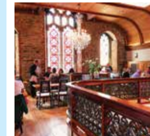
The Church Restaurant Skibbereen, Co. Cork