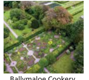
Ballymaloe Cookery School, Organic Farm & Gardens, Shop Shanagarry, Co. Cork