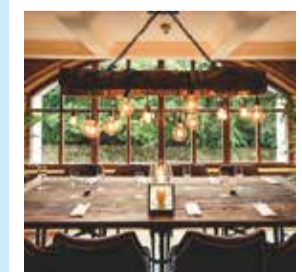
The Tan Yard Restaurant Killarney Plaza Hotel Killarney, Co. Kerry