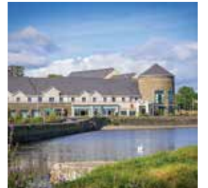
Celtic Ross Hotel Rossbarbery, Co. Cork